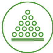
POWDER AND HARD METAL

PM Life will help provide the knowledge and experience needed to help you take the next step in your career.