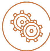
PRESS AND SINTER