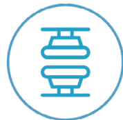
HOT ISOSTATIC PRESSING